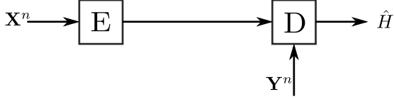
Fig. 1. Distributed hypothesis testing scheme

probabilities by demonstrating their consistency with Monte-Carlo simulations. Additionally, the paper compares the performance of the three schemes for sources of length n = 31 bits.