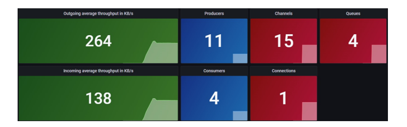
Fig. 2. Dashboard with general information from RabbitMQ

As depicted in figure 2, general information coming from RabbitMQ servers are displayed; the configuration used there is following the one presented in figure 1. We can observe the average throughput of all producers (i.e., incoming average), as well as for all consumers (i.e., outgoing average). The consumers' throughput is more important because messages are duplicated and sent to several queues.