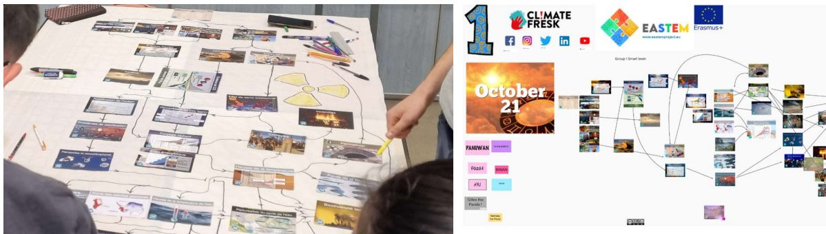
Figure 1.a Climate Fresk sample in 2021 with students at IMT Atlantique, and 1.b online with EASTEM curriculum designers

a constructive discussion, creating a will to act in the face of the challenge of an ecological transition (cf. Figure 1.a).