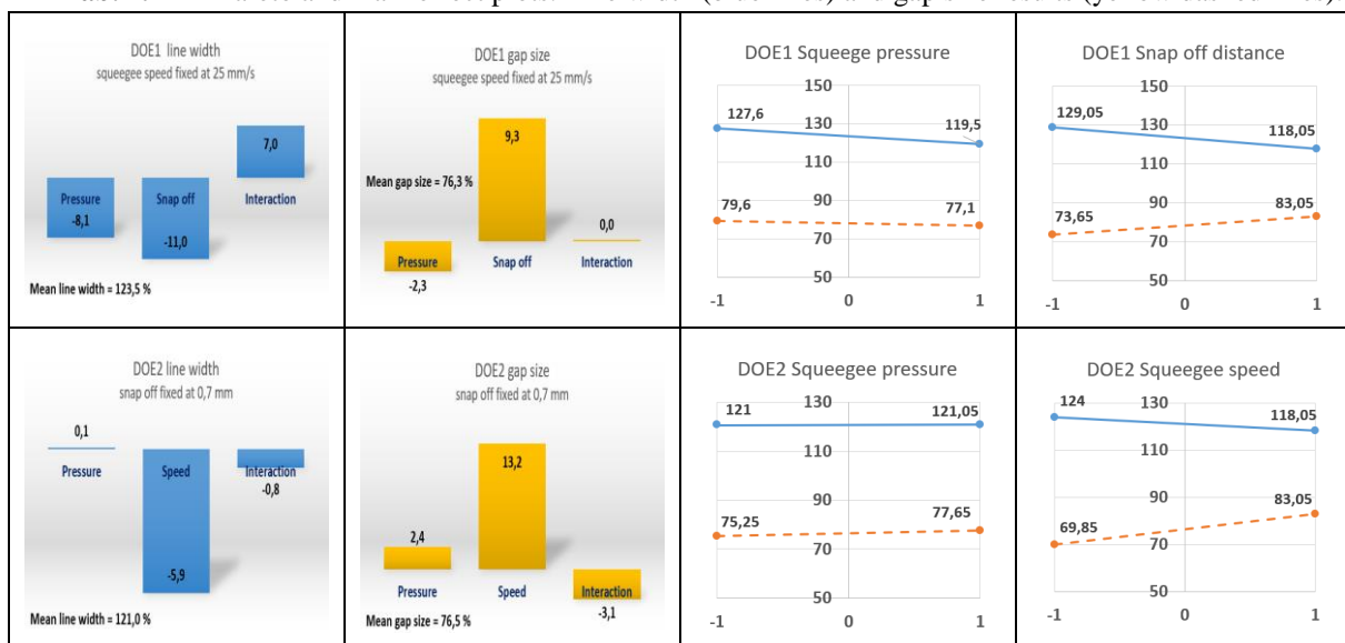
Tab. 2. Pareto and main effect plots. Line width (blue lines) and gap size results (yellow dashed lines).

Analyzing the impact of the different factors, we find that to obtain the best results for both the line width and gap size, we should choose a high squeegee pressure, a high snap off and a high squeegee speed. However, when the snap off is fixed at its high value the squeegee pressure becomes non-significant, still, the significant squeegee speed should be set at its high value.