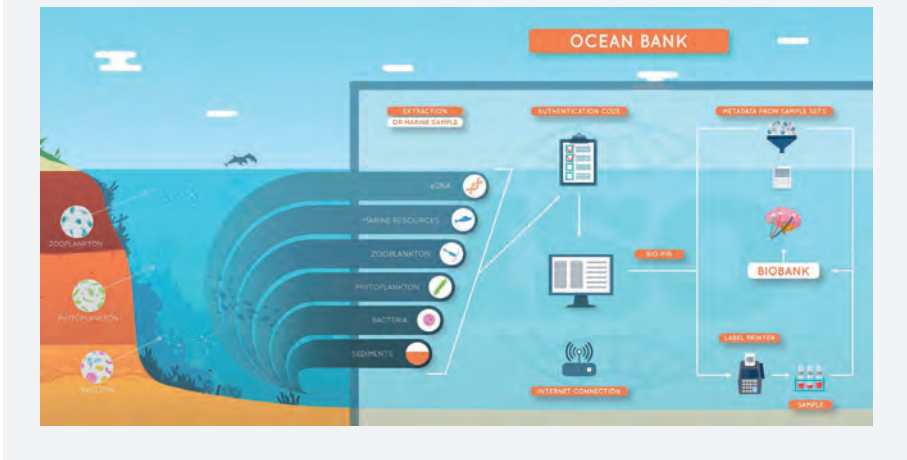
FIGURE 8.3 —The Ocean Bank can biobankise any ocean sample (i.e. zooplankton, DNA, sediments or tissue). The biobanking process can be integrated with AI-assisted analyses of Big Data.

This makes deep artificial neural networks very useful for modelling complex ecological systems, real-time monitoring and surveillance sources (Lamba et al. 2019).