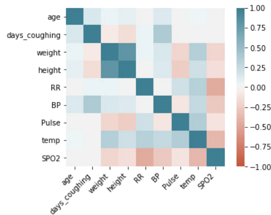
FIGURE 3 Correlation between numeric variables in the dataset

A negative correlation exists in Figure 3 between Peripheral capillary oxygen saturation (SPO2) and weight, height, respiration rate (RR), blood pressure (BP), pulse per minute, and body temperature. Body temperature in Figure 3 shows a positive correlation with weight, height, respiration rate (RR), blood pressure (BP), and pulse per minute. There does not exist a strong correlation (>80%) between independent variables except weight and height.