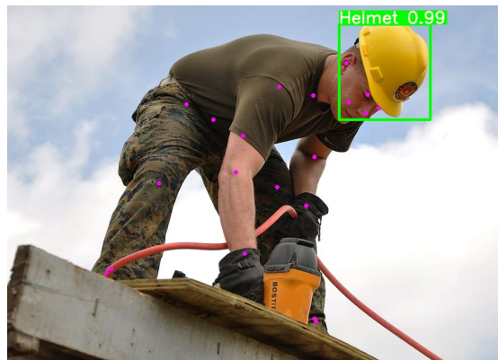
Fig. 1. Example of PPE detection in context using our approach.

Using domain knowledge to analyse a person's pose in relation to certain objects of interest, we can assess the conformal use of PPE by its proximity to certain body parts. By comparing the position of an equipment in question and the nearest most relevant body parts, it is possible to deduce whether it is properly worn through measurements in image space. The absolute scale of these measurements can be determined very accurately if needed by making use