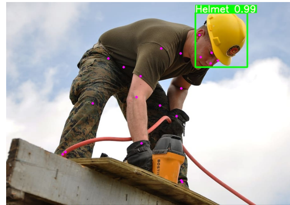
Fig. 1. Example of PPE detection in context using our approach.

Using domain knowledge to analyse a person's pose in relation to certain objects of interest, we can assess the conformal use of PPE by its proximity to certain body parts. By comparing the position of an equipment in question and the nearest most relevant body parts, it is possible to deduce whether it is properly worn through measurements in image space. The absolute scale of these measurements can be determined very accurately if needed by making use