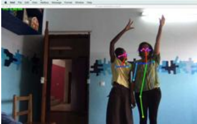
Figure 5: Openpose capture from the imitation phase with Participant G (1)

The non-detection of the left leg of Assistant C may be due to the strong lighting above.