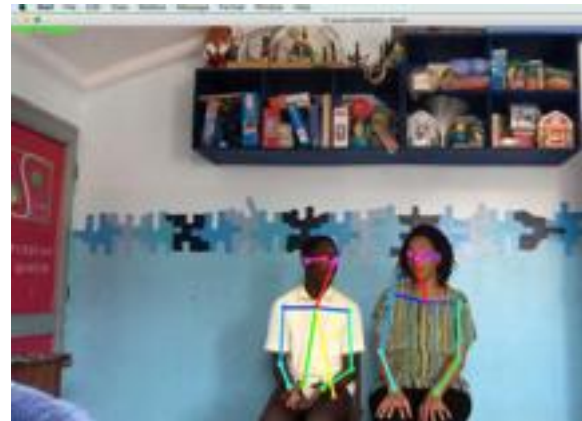
Figure 3: Capture of the pairing phase with Participant F

Below are some Openpose captures of the sessions with the participants, along with descriptions and analysis for the body parts not detected.