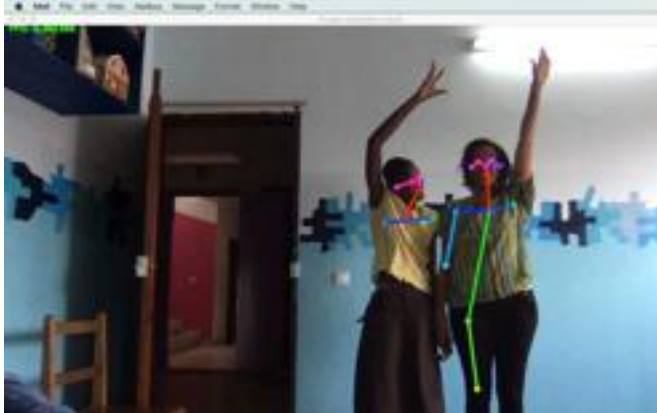
Figure 5: Openpose capture from the imitation phase with Participant G (1)

The non-detection of the left leg of Assistant C may be due to the strong lighting above.