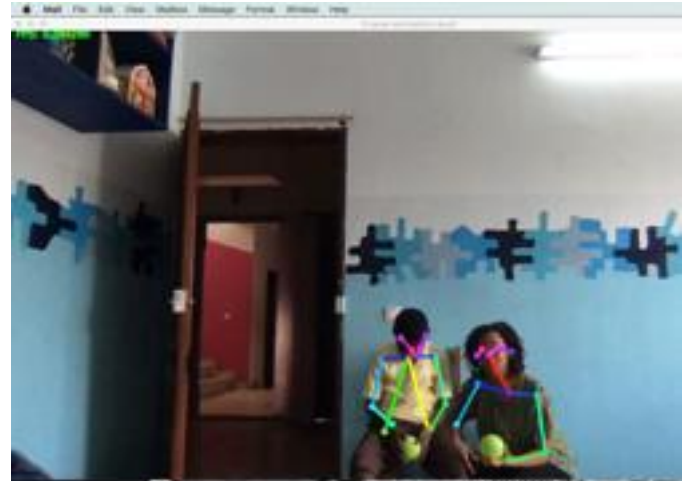
Figure 6: Openpose capture from the pairing phase with Participant H

The pairing phase with Participant H was intricate.