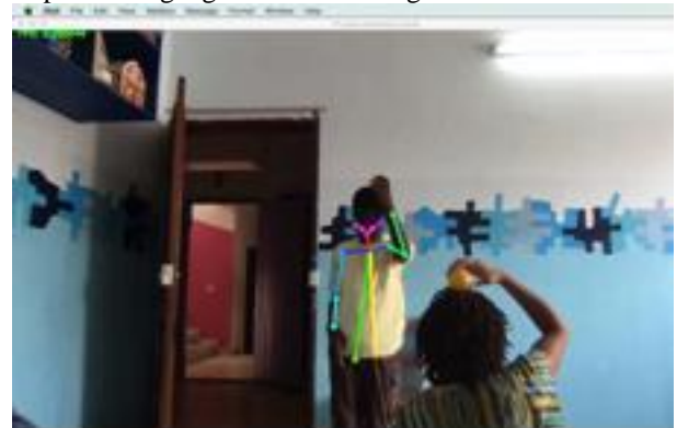
Figure 7: Openpose capture from the imitation phase with Participant H

This session required much patience and adaptability. Participant H finally imitated some of Assistant C's movements, as shown in Figure 7. It will be interesting to see how Participant H will react to an interactive robot implementing a gesture imitation game.