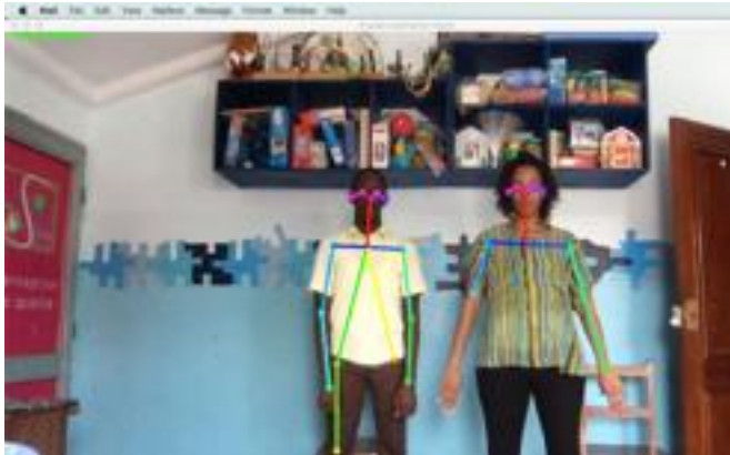
Figure 4: Capture of the imitation phase with Participant F

On Figure 4 below, which was captured during the imitation phase, Participant and Assistant C are standing in front of the camera. Openpose partially detected their skeletons. Due to the short distance between the camera and the participants, lowest body segments are not visible. The left leg of Participant F was not detected, maybe because the hand occluded part of it and the knee was not visible.