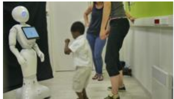
Figure 1: Interaction between a child with ASD and Pepper robot [3]

In [7, 8], it is shown how an interactive robot could bring positive results in terms of social interactions with autistic children. Several explanations such as predictability, simplicity in the movements, absence of implicit communication messages, or simpler face expressions than those of human beings (see Figure 1), have been proposed.