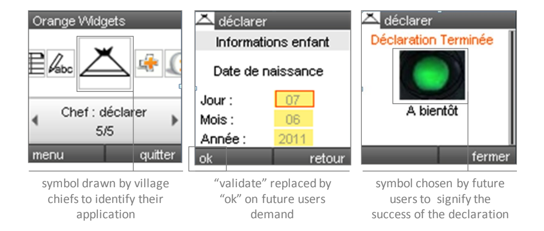
Figure 2: screenshots of Birth Registration service

Some examples of suggestions of future users, applied in the design of services are illustrated in figure 2.